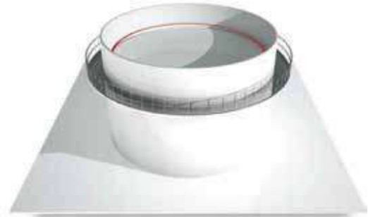
Floating Roof Tanks